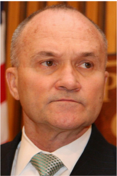
Raymond W. Kelly Police Commissioner of New York City